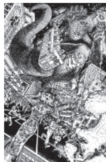
Alan Moore’s pin-up of Japan’s most famous movie star, from Godzilla, King of the Monsters Special #1.

Artwork ©2003 Alan Moore. Godzilla ©2003 Toho Co., Ltd.